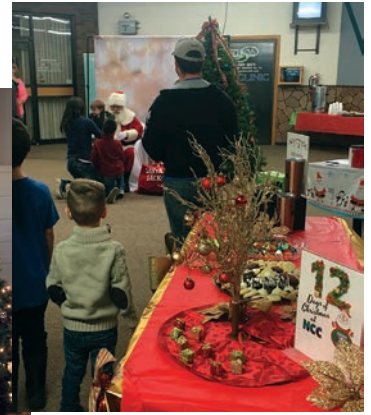
Santa with the kids at the NCC 12 Days of Christmas event.

We enjoy participating in and sponsoring your community events! We had fun with these Christmas events in December: